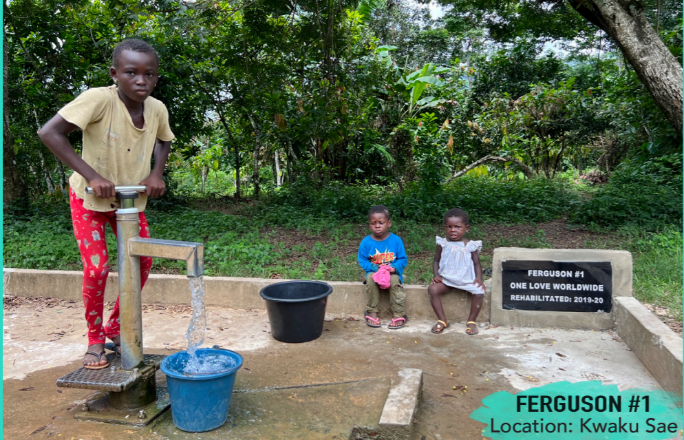
FERGUSON #1 Location: Kwaku Sae