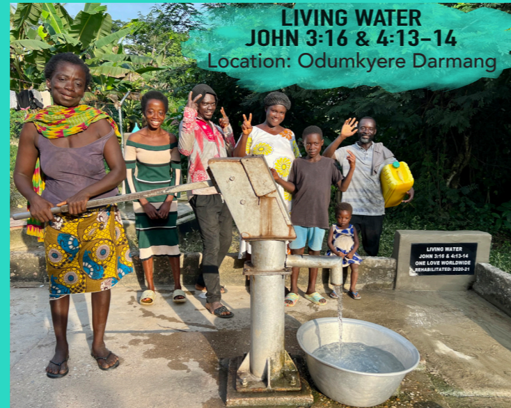
LIVING WATER JOHN 3:16 & 4:13-14 Location: Odumkyere Darmang