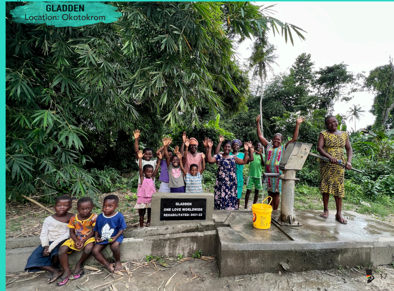
GLADDEN Location: Okotokrom