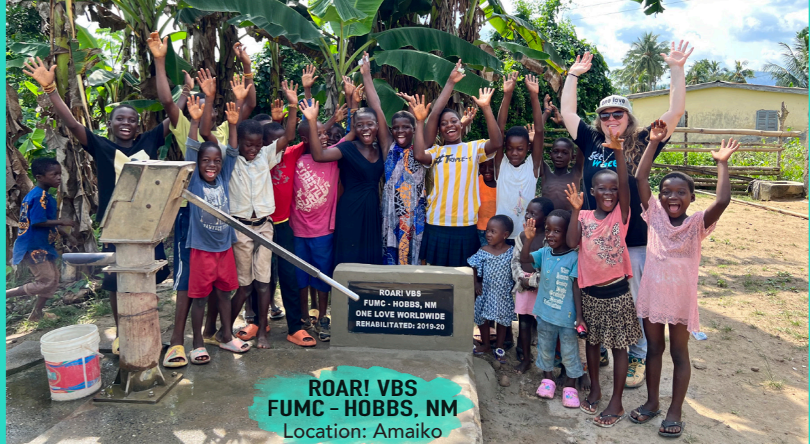
ROAR! VBS FUMC - HOBBS, NM Location: Amaiko