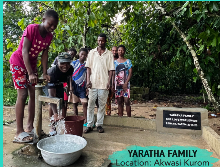
YARATHA FAMILY Location: Akwasi Kurom