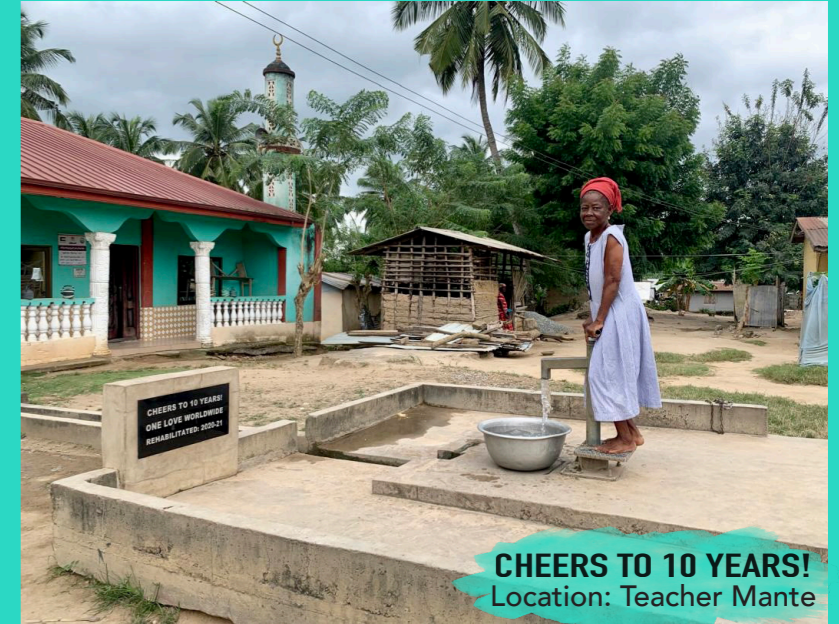
CHEERS TO 10 YEARS! Location: Teacher Mante

One Love Worldwide originated in 2010 after our founder's 2009 visit to the village of Teacher Mante. Our very first project was drilled in this community. Our headquarters is located here; this is our hometown. As we celebrated a decade of work in Ghana, we completed another project in Teacher Mante. Cheers to 10 years!