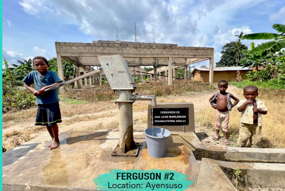
FERGUSON #2 Location: Ayensuso