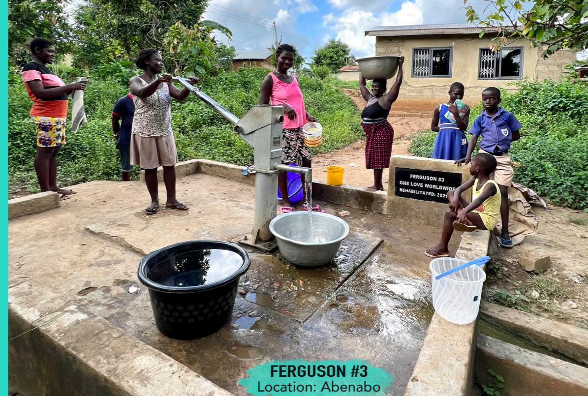
FERGUSON #3 Location: Abenabo