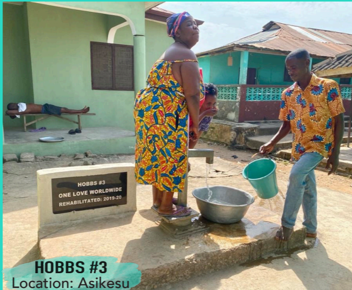
HOBBS #3 Location: Asikesu