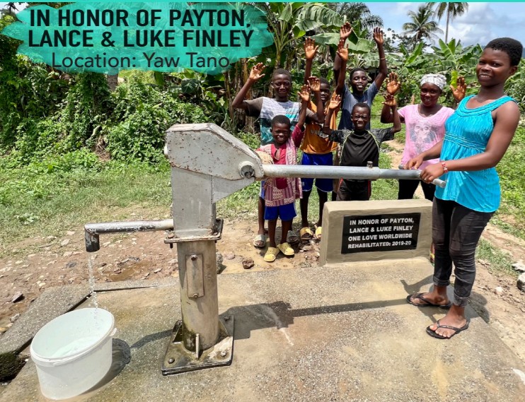
IN HONOR OF PAYTON, LANCE & LUKE FINLEY Location: Yaw Tano