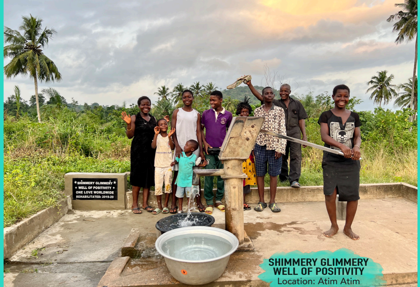
SHIMMERY GLIMMERY WELL OF POSITIVITY Location: Atim Atim

Since we built our OLW headquarters in 2013, we have not had a borehole. For six years, we fetched water from the Teacher Mante community borehole that we drilled in 2010. We hauled five gallon jerry cans three at a time on a motorcycle, fetched the water and returned to fill 60 gallon drums at the house. We put others first, as we had 54 water projects before drilling this borehole. We definitely know the value of safe access to clean water and are grateful to have running water.