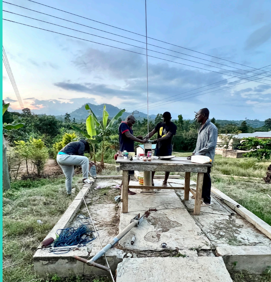
JOHN 4:13-14 Location: Duodukrom

Duodukrom's water source was in bad condition. We offered to rehabilitate their pump if the community repaired the cement platform. When a community is invested in their water source, they take care of it. With some persistence on our part, the community nicely repaired their platform, and we repaired their pump.